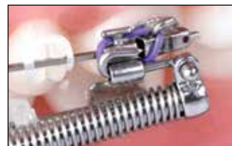
FORSUS™ Fatigue Resistant Device

Choose a wide variety of colours to match patient preference.