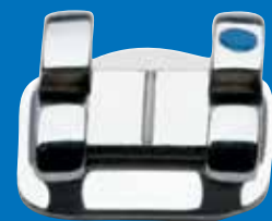
Victory Series™ Low Profile Bracket

power and versatility to handle the variability found in each new case and achieve consistent patient outcomes.