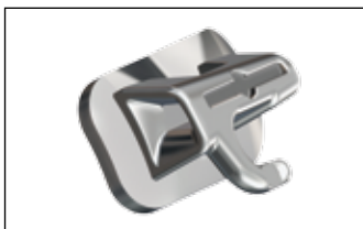
Victory Series™ Superior Fit Buccal Tubes