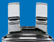
Traditional Miniature Bracket