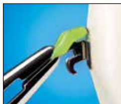
AlastiK™ Easy-To-Tie Ligatures

AlastiK™ Easy-to-Tie Ligatures are angled to make ligature placement easy for you and your patients.